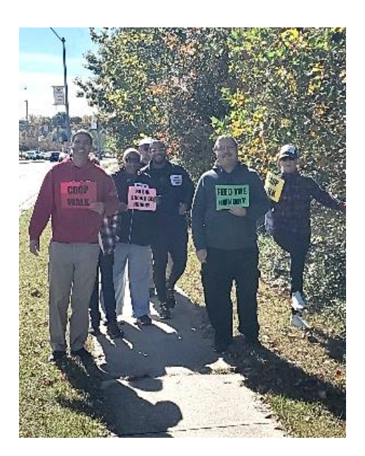
Camp Chapel's CROP Hunger Walk team gets in their steps.

Again this year, a team from Camp Chapel participated in the CROP Hunger Walk. The walk was held on October 27, raising $728 for food pantries, both local and around the world. Overall, it was a great experience to get outside, get some exercise, enjoy conversation with church friends, and raise funds for a good cause.