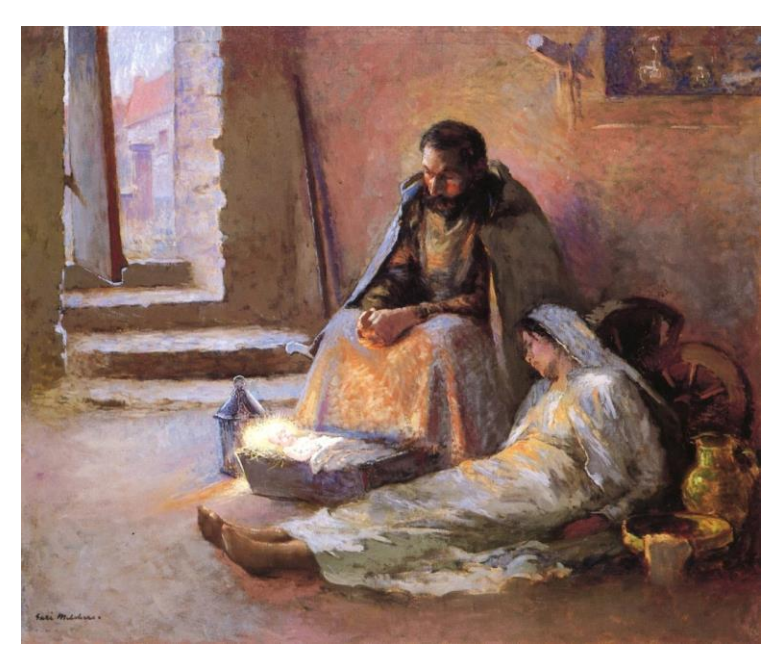
The Nativity by Gari Melchers, circa 1891

Author's note: Pavane for a Silent Night is just one of the selections that will be presented on Sunday, December 8, at 4 pm. I hope all of you reading this can attend the Music of the Holidays concert to hear the Bell Choir, the Chancel Choir, guest artists and members of our congregation entertain you with all categories of Christmas music!