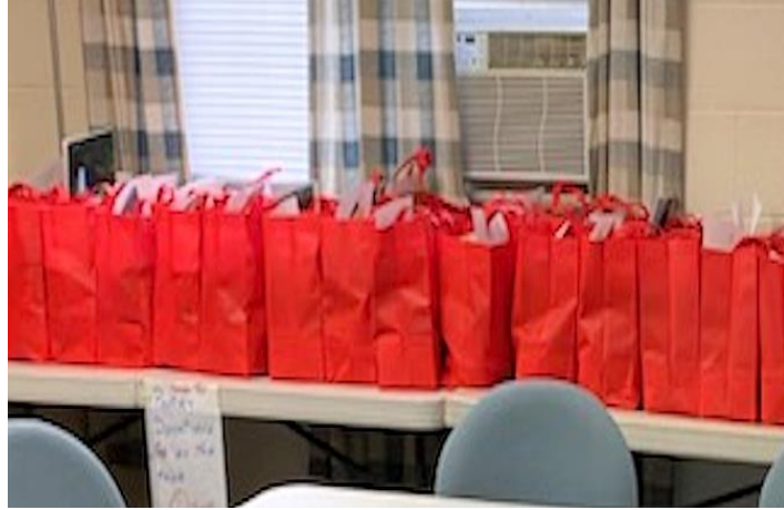
Just some of the food collected for the Thanksgiving Food Baskets

The Thanksgiving Food Basket collection was a huge success, and again, the generosity of our congregation was inspiring! Now, we move ahead with the collection for the Christmas Food Baskets which will be distributed to 50 families on Saturday, December 14. Once again, each basket will include the following 13 items: