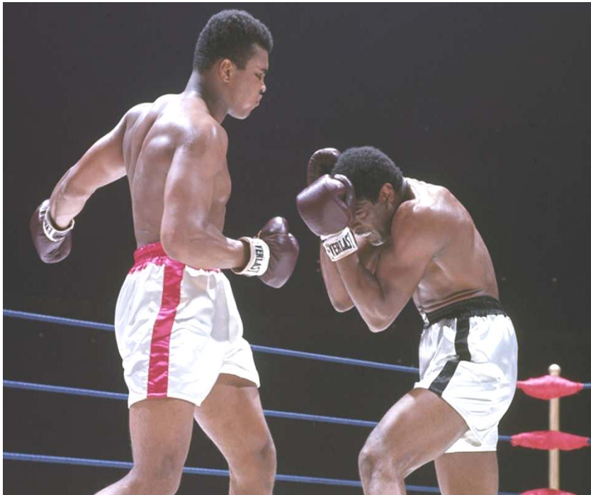
Muhammad Ali (left) vs. Ernie Terrell