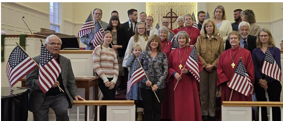
Friends and families of veterans remembered at the 11:00 service