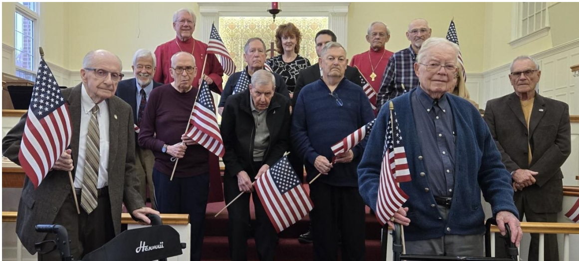
Veterans honored at the 11:00 service