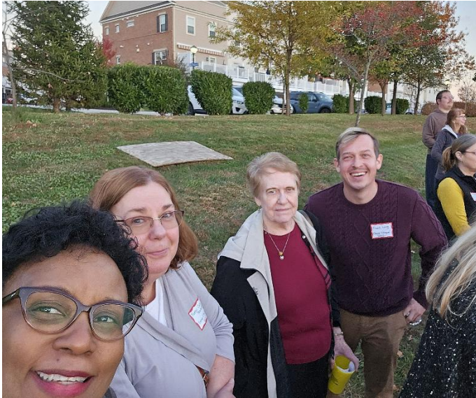
Camp Chapel was honored to be represented at the ceremony