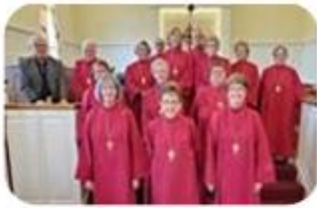
Choir Appreciation Sunday Sunday, May 24, Noon